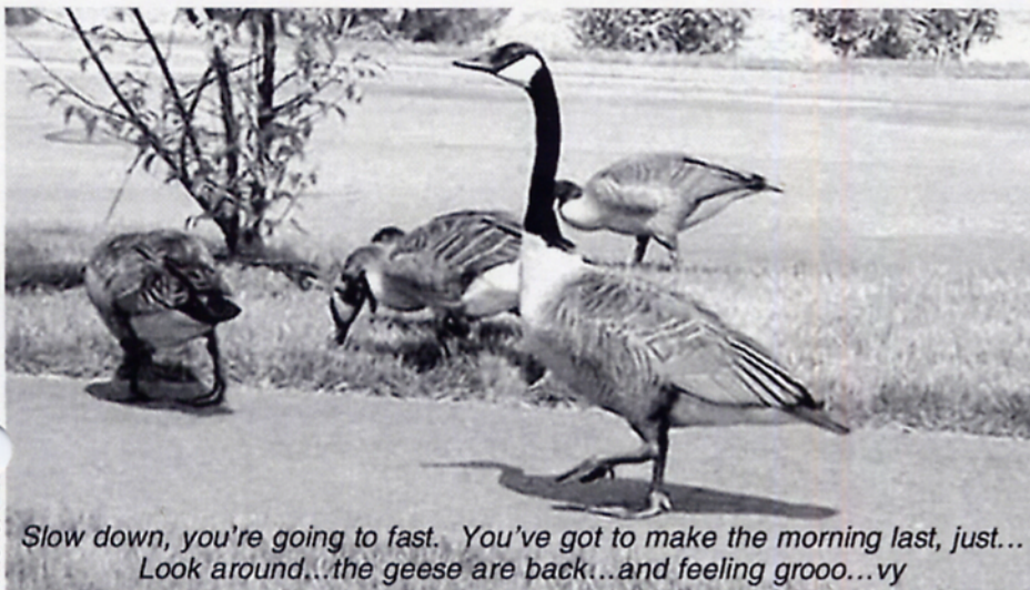
Slow down, you're going to fast. You've got to make the morning last, just... Look around...the geese are back...and feeling grooo...vy