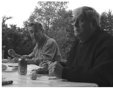
Can we put a profit on this

Many of the attendees including myself were not cigar smokers and chose to take their cigar back for the cigar smokers in their family. The end of the evening was signaled by sunset, promises of all types, good byes of all types, and sweet smelling smoke.