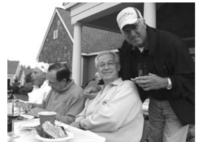
Skip prefers to smoke cookies