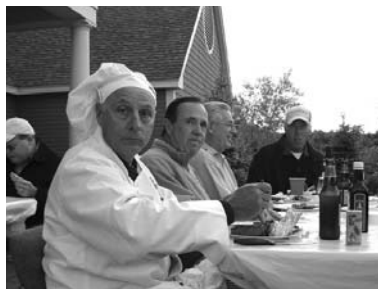
This is so good I will leave my hat on