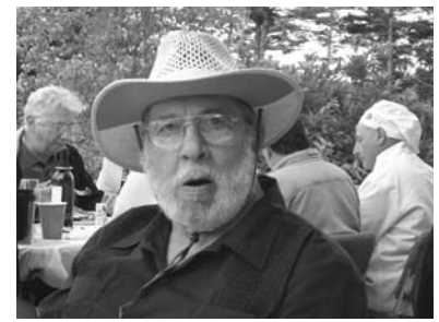
Did I say you could take my picture?