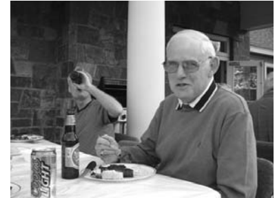
No smell from the WWTF