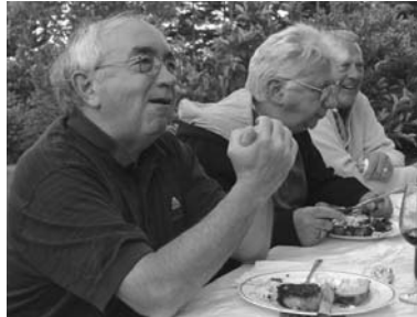
It was 300 yards and straight