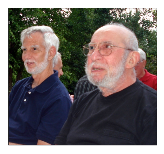
The grey beards wait for the "Steak's ready!" call.