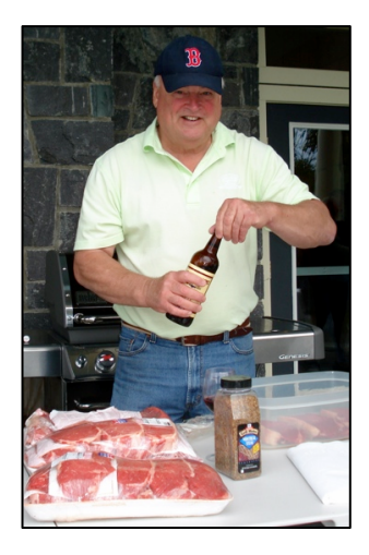
I have my secret sauce.