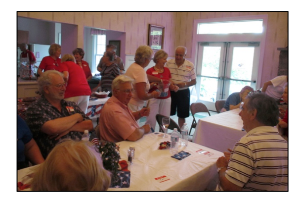
4<sup>th</sup> of July at the Village