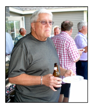
I'm ready now; where's my steak?