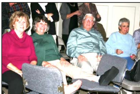
Some folks will do anything to get out of dancing!