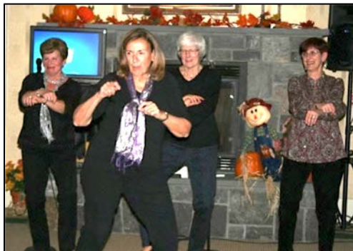
VSR Dancing girls