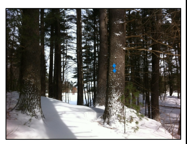
VSR trails were busy with skiers and snowshoers after our beautiful winter storm.