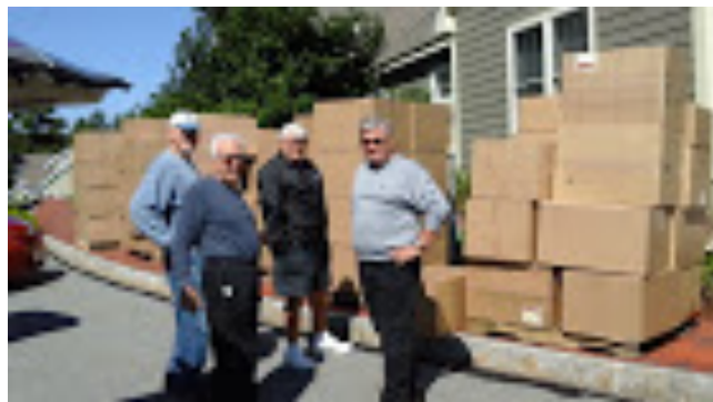
The crew gets ready to distribute the boxes.