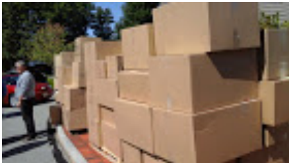
The pallets arrive at the clubhouse.

VSR ordered over 4000 bulbs for homeowners, 200 bulbs for outdoor garage