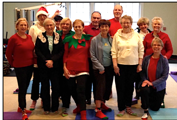
Yoga participants show their holiday style with colorful socks.