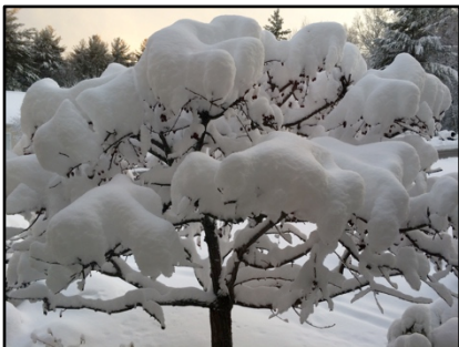
Winter has arrived in the Village.