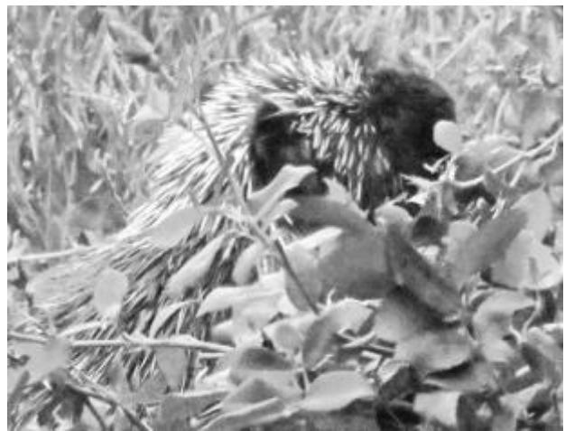
A young Cooper hawk learning how to get a bite to eat and an unusual rabbit & squirrel tete-a-tete and a rosebud-eating porcupine