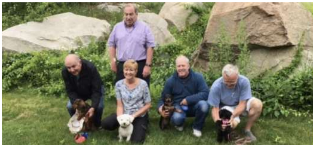
Celebrating Brody Rorke's 5th Birthday, were fellow four-legged Villagers (left to right) JoJo Sangiolo, Brody Rorke, Toby Tocci-Hamel, and Gracie MacPherson. Frosty Paws ice cream was enjoyed by all.