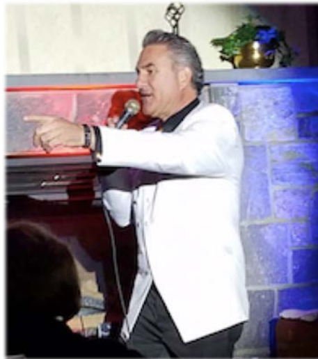
Who is he? Tom Jones, Frank Sinatra, Rod Stewart, Dean Martin???