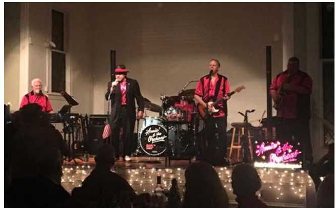
And Rockin' with VSR since 2016!