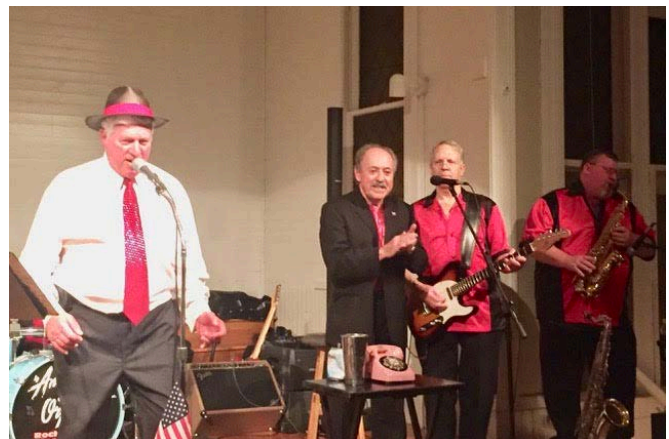
Skip belts out a tune Ah, let's go to the hop, oh baby Let's go to the hop