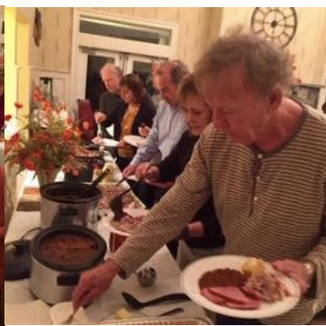
Delicious food was in abundance.