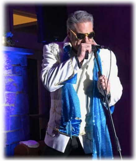
Elvis has entered the building!