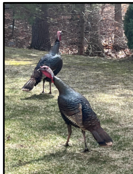
No VSR turkey will be served

Hot dogs and hamburgers, assorted salads, watermelon, ice cream and BYOB. $10 per person. There will be a 50/50 raffle.