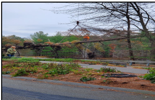
Good Bye old tree